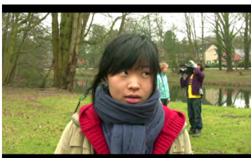
Social Promo Spot DV, 00:54', 2011 March