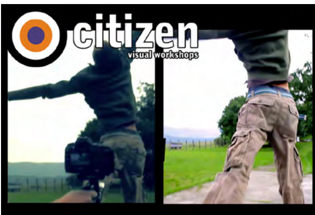
Media Educational Video DV, 02:49'', 2010 September